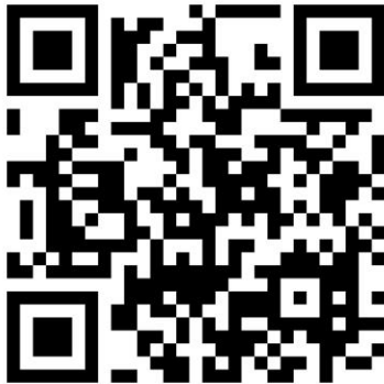
Hospital Huddles Case Study