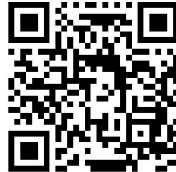
Hospital Huddles Further Detail